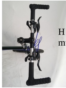
H Bars for longer rides, multiple hand positions