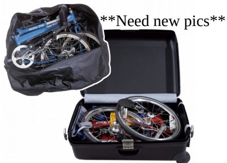
**Need new pics**