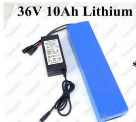
**Need new pics**